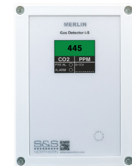
S&S CO2 iS Detector