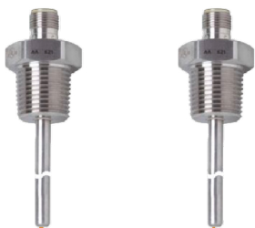
2-WIRE PT100 RTD SENSORS